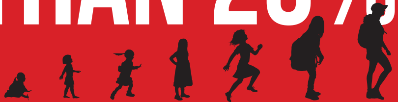
Boosting parental involvement: Results from a national survey of parents, Public Agenda, 2012

OF PARENTS CAN NAME A BASIC MILESTONE THEIR CHILD SHOULD HAVE REACHED IN SCHOOL OVER THE PREVIOUS YEAR.