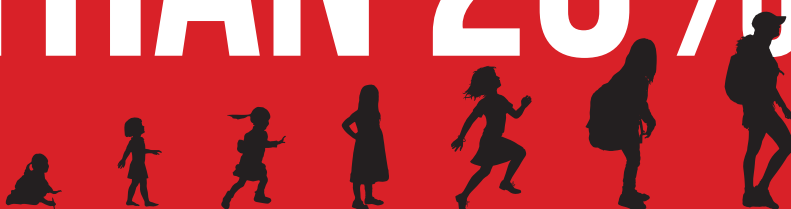
Boosting parental involvement: Results from a national survey of parents, Public Agenda, 2012

OF PARENTS CAN NAME A BASIC MILESTONE THEIR CHILD SHOULD HAVE REACHED IN SCHOOL OVER THE PREVIOUS YEAR.