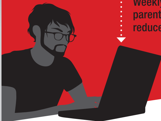
The Underutilized Potential of Teacher-to-Parent Communication: Evidence from a Field Experiment, Kraft & Rogers, 2014