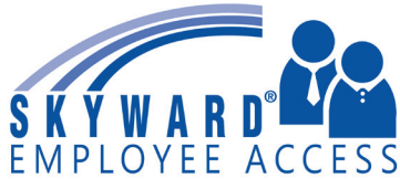
Skyward Employee Access

The following logos are available in various file formats for print or digital use.